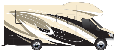
Cliffcrest Paint Package

*Chassis warranty is 36 Months/3 Years. Diesel engine is 5 years/100,000 miles. All above standard and options are based on the initial prototype. Jayco reserves the right to make any changes without notification.