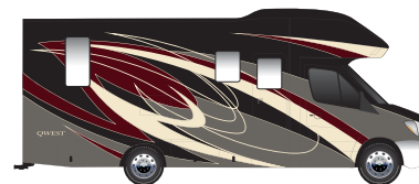
Skywatch Paint Package