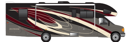
Voyage Paint Package