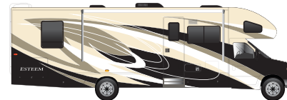
Carefree Paint Package