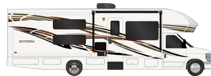
Nutmeg Graphics Package

(2) 24" LED TV's in Bunk Area (31L only) 12 cu.ft. refrigerator (29V & 30X only) Aluminum rims Full-body paint (comes equipped w/ slideout cover awnings)